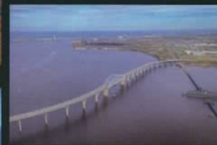
Twin Ports Bong Bridge