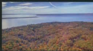
North Shore Fall Colors

Departing daily on the hour from Sky Harbor Airport on spectacular 7 mile Park Point in Duluth, MN!